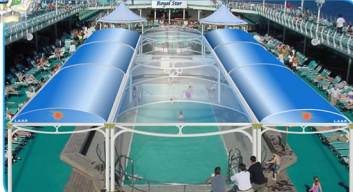
Cruise Ship - Retractable Roof project 03CS/05