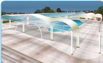
Swimming Pool - Retractable Roof project VILLA3T/04