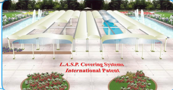
Swimming Pool - Retractable Roof project VILLA3Q/04

L.A.S.P. Covering Systems International Patent