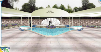
Swimming Pool - Retractable Roof project VILLA3S/04