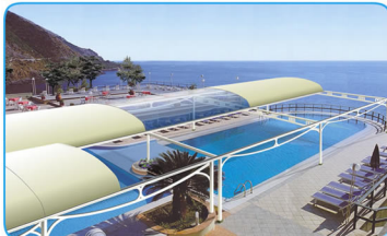
Swimming Pool - Retractable Roof project 1SSD/2005

Great coverings • Retractable Telescopic Roofs • International Patent