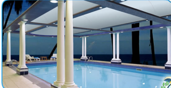
Swimming Pool - Retractable Roof project 03SW/2004

L.A.S.P. Covering Systems International Patent