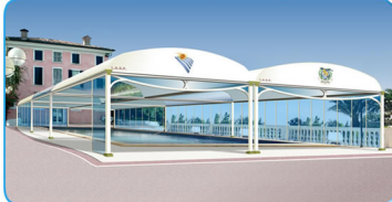
Swimming Pool - Retractable Roof project 09VT/2005